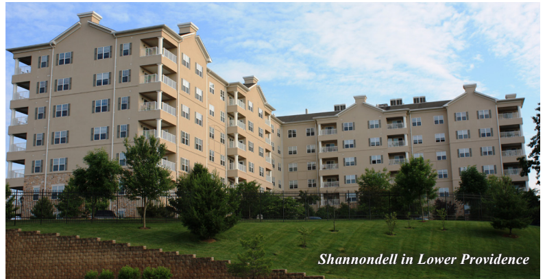
Shannondell in Lower Providence

Residents ages 65 and over made up about 15% of the county’s population as of the 2010 Census and will grow to nearly a quarter of the county’s population by 2025. The county’s senior population, and those in the age bracket just below them (at ages 55-64), have a significant impact on the county’s residential construction trends. Overall, Montgomery County has seen a large increase in age restricted housing over the past decades – that is, independent living housing for those primarily over the age of 55 – either proposed for construction or already built.