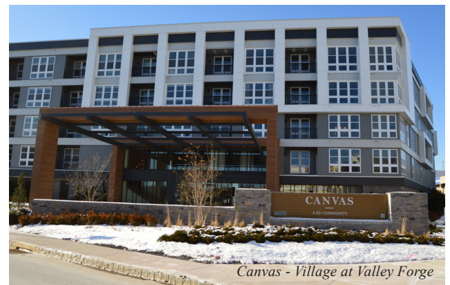
Canvas - Village at Valley Forge

This current inventory lists 115 age restricted developments with more than 17,600 independent living units across the county. One new age restricted development was completed in 2018, in addition to new units that were added to existing developments or were newly inhabited in 2018. This inventory, also includes independent units within the county’s continuing care retirement communities. Some of these developments may likely shift to being age targeted in the future - that is to say, open to residents of all ages but still with the amenities that would appeal to older residents - as the county begins seeing increases in their younger population groups and baby-boomers downsize.