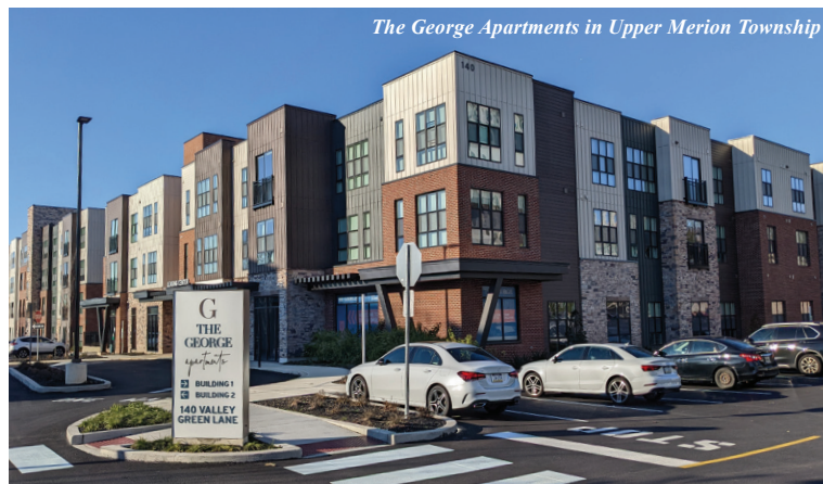
The George Apartments in Upper Merion Township

Total Single Family Attached units: 43,377