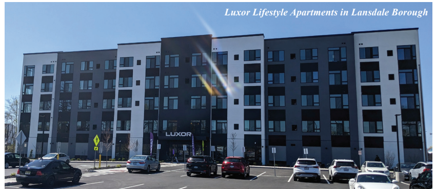
Luxor Lifestyle Apartments in Lansdale Borough

The multifamily and attached housing inventory sheds some light on the housing preferences of the county's residents. For inclusion in this inventory 1) a development must have at least ten (10) dwelling units, and 2) in most cases, a common element to unify the development, such as open space, lobby, parking area, or clubhouse. This inventory includes market-rate housing as well as homes which meet special needs, such as subsidized or age-restricted developments. All information provided is accurate to December 2022.