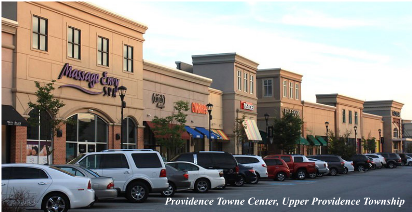
Providence Towne Center, Upper Providence Township

This report contains an annually updated inventory of shopping centers and a map showing approximate locations for each. By providing the information on existing centers, their locations, and characteristics, this report not only provides a useful resource for shopping but also, when combined with other available information, suggests where opportunities may or may not be for the development of additional shopping centers and retail opportunities in the county. The retail additions to the county are accurate to the end of 2023.