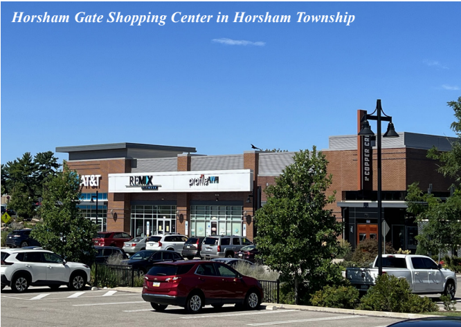
Horsham Gate Shopping Center in Horsham Township

As of the end of 2023, there were a total of 151 shopping centers in Montgomery County. The total amount of gross floor area for shopping centers in this inventory is 30,868,558 square feet, an increase of over 5.6 million square feet in the last 16 years. Based on the latest population estimate for Montgomery County about 868,000 residents in 2023 there are about 36 square feet of shopping center floor area per county resident, a number that has increased over the years. According to the Lincoln Institute of Land Policy, the national average was currently about 24 square feet per capita in 2019, a number that has not changed much in recent years. Clearly, Montgomery County is well over the average for available shopping center space, though it is important to note that many of the county’s shopping destinations serve residents of surrounding counties.