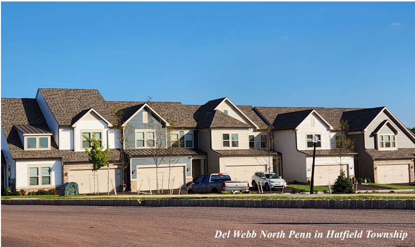
Del Webb North Penn in Hatfield Township

Residents age 62 and over represent 25% of the county’s population. This has a significant impact on the county’s residential construction trends and needs. The inventory tallies up all age restricted independent living units, including those within the county’s continuing care retirement communities (CCRCs), whether completed or in ongoing construction. Nursing homes, boarding homes, personal care or assisted living developments, and proposed developments not yet under construction are not included. The data reflects development activity for the 2024 calendar year.