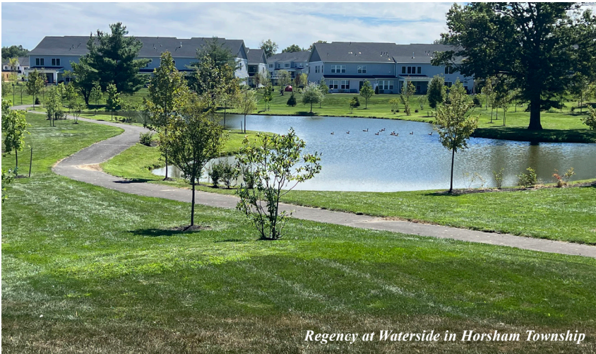
Regency at Waterside in Horsham Township

+267 units in three existing developments.