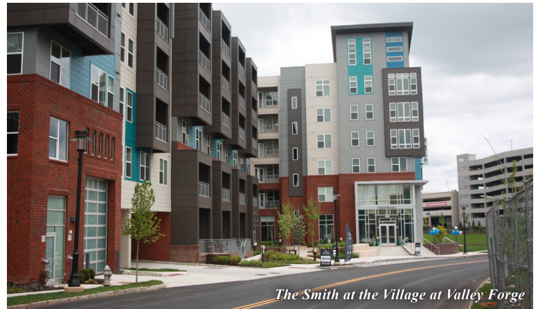
The Smith at the Village at Valley Forge

The multifamily and attached housing inventory sheds some light on the housing preferences of the county’s residents. For inclusion in this inventory a development must have at least ten (10) dwelling units, and in most cases, a common element to unify the development, such as open space, lobby, parking area, or clubhouse. This inventory includes market-rate housing as well as homes which meet special needs, such as subsidized or age-restricted developments. All information provided is accurate to December 2018.