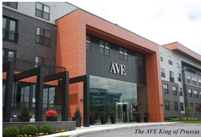
The AVE King of Prussia

Multifamily and attached housing are important housing types in the county—in recent years, these housing types have made up more than 70 percent of the new housing construction. This inventory covers nearly 100,000 attached and multifamily housing units. Although smaller apartment buildings and neighborhoods of older rowhomes are not included in this inventory, the inventory still covers about two-thirds of the county’s attached and multifamily housing units. This includes over 550 multifamily developments, both rental apartments and condominium complexes, with more than 61,600 units countywide. The county also has nearly 400 developments with attached homes, totaling more than 39,700 units.